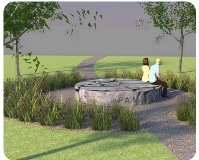
*Mockup of Memorial pictured above

For our community , the memorial confronts the stigma that has historically been associated with drug poisoning.